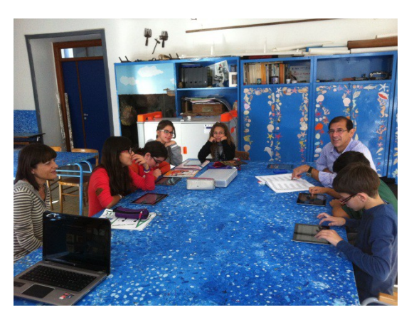
Il Museo del Mare