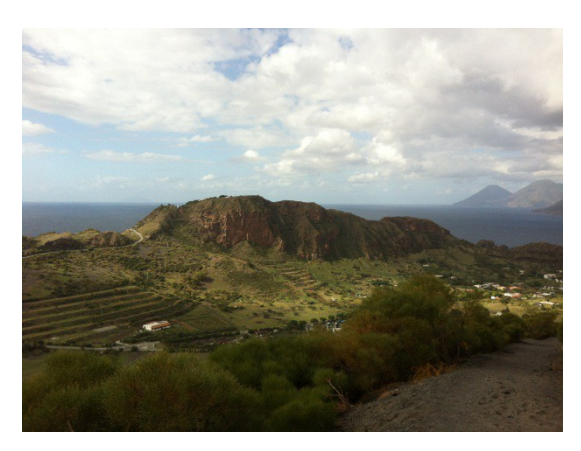
Panoramico di Vulcano