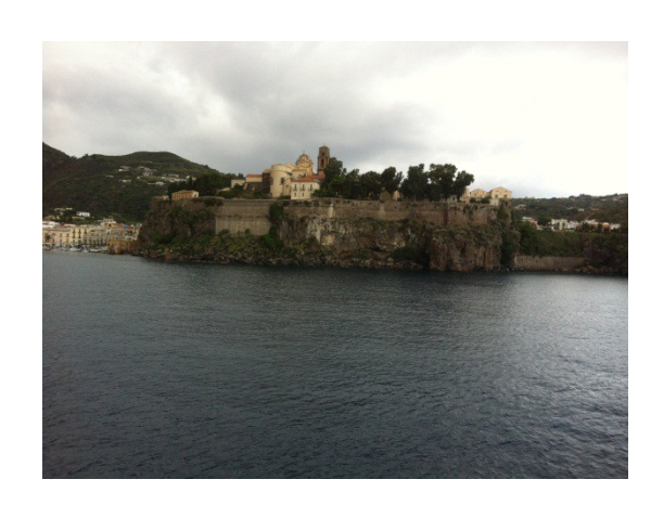
Il porto di Lipari