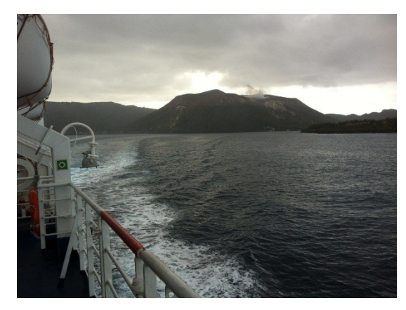
Viaggio da Milazzo